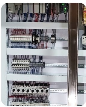
New Ashworth System

www.ashworth.com Toll Free: 866-204-1414